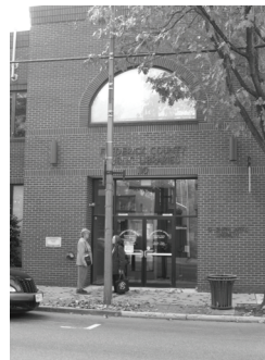
Literacy Council office on East Patrick St. in downtown Frederick, MD.

Do you know of someone who might need our help? Call 301-600-2066