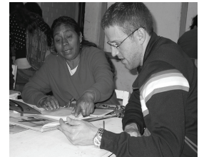
Tutor finds teaching very rewarding